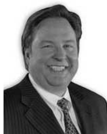
Click to enlarge Brian Andrews, Deputy Commissioner of Treasury.

Two people died in a plane crash near Sitka, two others - including the deputy commissioner of the state Department of Revenue - are missing on a plane that disappeared near Juneau, and troopers are on the lookout for a plane that may be missing on the Kenai Peninsula.